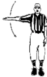
I used to be a water pump.