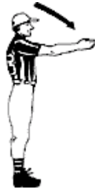
Tomahawk chop. Fuck, what sport is this again?