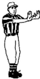
Keep the dog away. Every time I make a call, he lifts his leg.