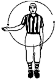
Do you think I'm more of a Shark or a Jet?