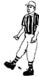
You put your right foot in, you take your right foot out...