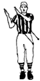
I'm a performance artist. You wouldn't get it anyway; don't waste my time.