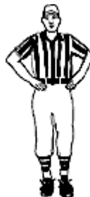
I think that last corndog went straight to my hips. Do I look fat to you?