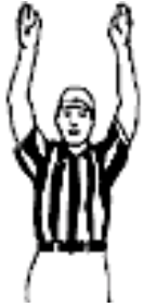
I'm the woman!