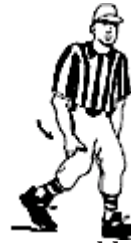
The doctor told me to eat more fiber, but this is asinine