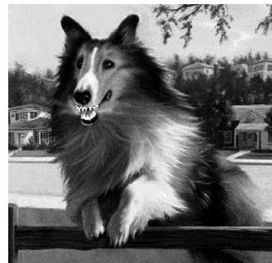
The climactic 'rabies epidemic' scene

According to the press release, the premise of the movie revolves