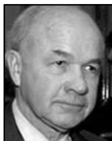
Enron CEO Kenneth Lay

I didn't learn anything from Captain Planet. Before I met him, I was an egotistical bitch with a bad haircut who let her dreams of being a mad scientist get in the way of making money. Now I'm still an egotistical bitch, but my old lab experiments are making me go bald.