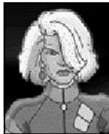
Dr. Blight, the Eco-villain

As a vegetarian, I find it morally appalling that the heroes of Captain Planet and the Planeteers ate hamburgers while claiming to protect the environment. Our children are too ignorant these days; they're vulnerable to the propaganda-like messages displayed on TV. Next thing you know, this self-styled "Captain" Planet will get himself elected Chancellor and oversee the horrific deaths of millions...of cows.