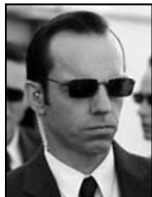
Agent Smith, Robot

From the oil fields of Iraq comes Saddam, with the power of Insanity! From the slums of Iran comes Ayatollah, with the power of Fanaticism! From the playboy mansions of North Korea comes Kim, with the power of Shoddy Electronics! By our powers combined, we summon evil's greatest champion: Captain Vague Foreign Threat!